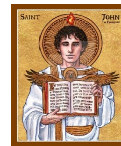
St. John the Evangelist

(6 months minimum notice is needed for Marriage)