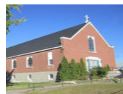
St. John Church Garson