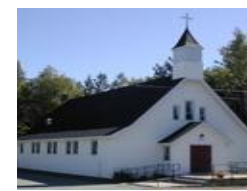
St. Bernardine Church Skead