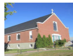
St. John Church Garson