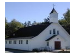
St. Bernardine Church Skead