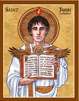
St. John the Evangelist