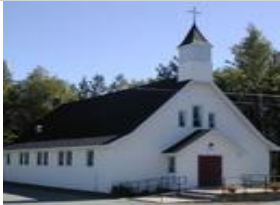
St. Bernardine Church Skead