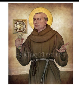
St. Bernardine of Siena