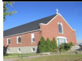
St. John Church Garson