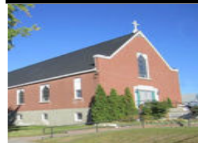
St. John Church Garson