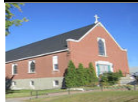
St. John Church Garson