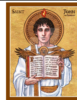
St. John the Evangelist