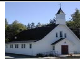
St. Bernardine Church Skead