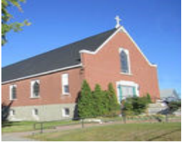
St. John Church Garson