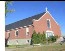
St. John Church Garson