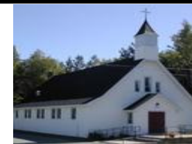
St. Bernardine Church Skead