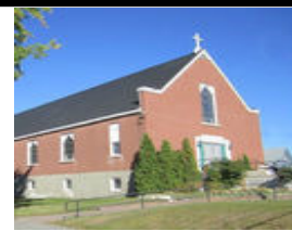
St. John Church Garson