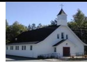
St. Bernardine Church Skead