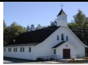
St. Bernardine Church Skead