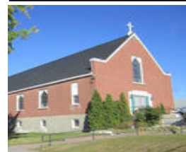
St. John Church Garson