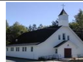
St. Bernardine Church - Skead 75 Years: 1947 - 2022