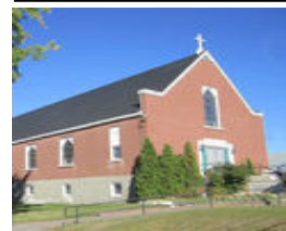
St. John Church Garson