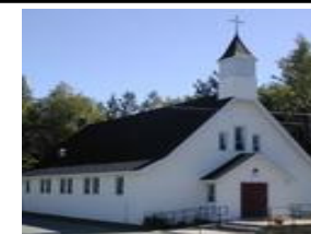
St. Bernardine Church - Skead 75 Years: 1947 - 2022