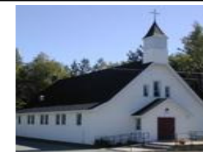
St. Bernardine Church - Skead 75 Years: 1947 - 2022