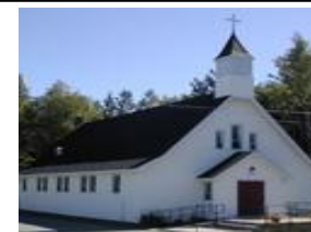
St. Bernardine Church - Skead 75 Years: 1947 - 2022