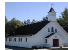
St. Bernardine Church - Skead 75 Years: 1947 - 2022