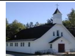
St. Bernardine Church - Skead 75 Years: 1947 - 2022