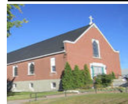
St. John Church Garson