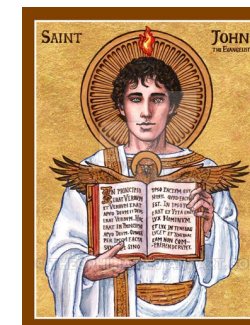
St. John the Evangelist