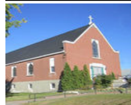
St. John Church Garson