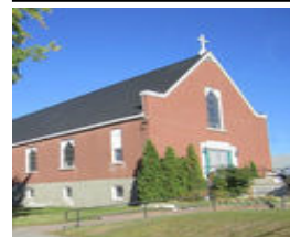
St. John Church Garson