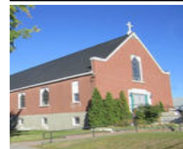
St. John Church Garson