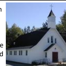
St. Bernardine Church - Skead