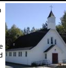
St. Bernardine Church - Skead