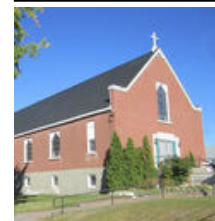
St. John Church Garson