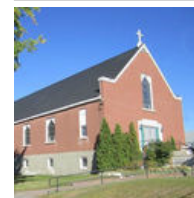
St. John Church Garson