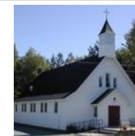
St. Bernardine Church - Skead