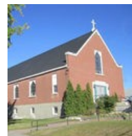
St. John Church Garson