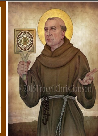
St. Bernardine of Siena