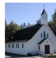
St. Bernardine Church - Skead

September 13, 2020 TWENTY-FOURTH SUNDAY IN ORDINARY TIME