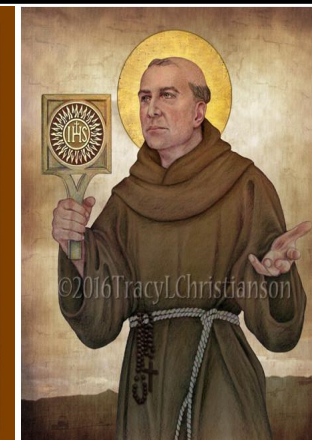
St. Bernardine of Siena