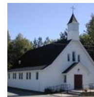
St. Bernardine Church - Skead