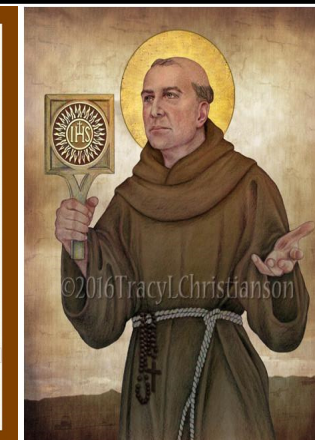
St. Bernardine of Siena