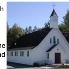
St. Bernardine Church - Skead