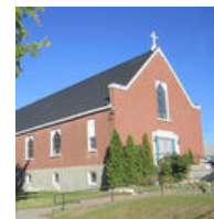
St. John Church Garson