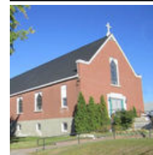
St. John Church Garson