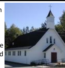
St. Bernardine Church - Skead