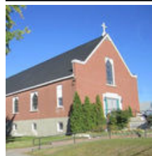
St. John Church Garson