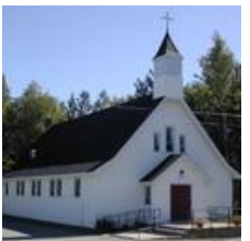
St. Bernardine Church - Skead

SUNDAY MASSES Saturday 4:30 pm. St. John the Evangelist Sunday 9:00 am. St. Bernardine of Siena Sunday 10:30 am. St. John the Evangelist WEEKDAY MASSES See in side for this week's schedule