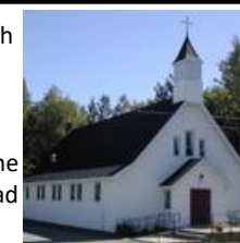
St. Bernardine Church - Skead