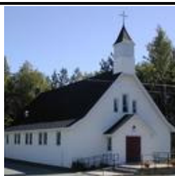
St. Bernardine Church Skead