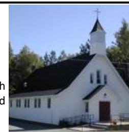
St. Bernardine Church Skead