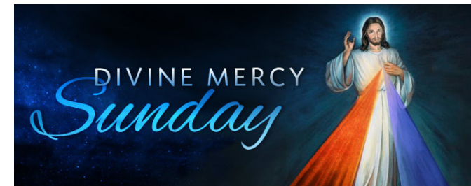
"Humanity will not find peace until it turns trustfully to divine mercy." (St. Faustina's Diary, p. 132)